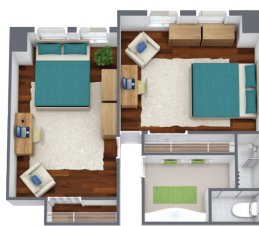
Deluxe Suite Bedroom (available on a limited basis)

All first-time, full-time students who graduated high school within the last 12 months and are not commuting <60 miles from their legal parent/guardian home address must live on campus. Contact Housing to determine eligibility.