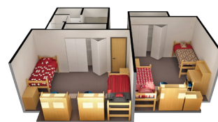
Shared Bedroom or Deluxe Private Bedroom (available on a limited basis)