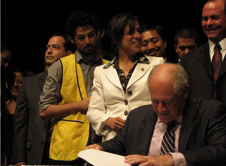
Governor Pat Quinn signs the IL Dream Act into law on Monday August 1st, 2011 at Chicago's Benito Juarez High School.