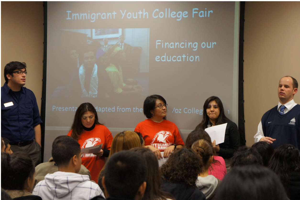
Ask college financial aid advisors questions about financial aid opportunities for undocumented students.