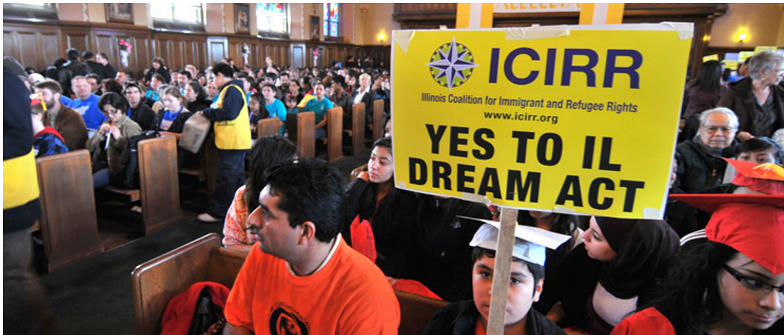
At a Chicago New Americans Rally on April 30 in support of the IL DREAM Act