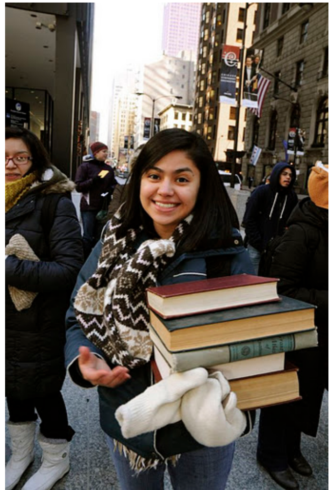
At an Immigrant Youth Justice League Rally in December 2010 in Chicago. Start a club within your own school to support undocumented students!