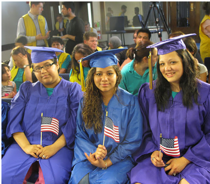
Students and supporters with ICIRR at a press conference after the IL DREAM Act passes the House.