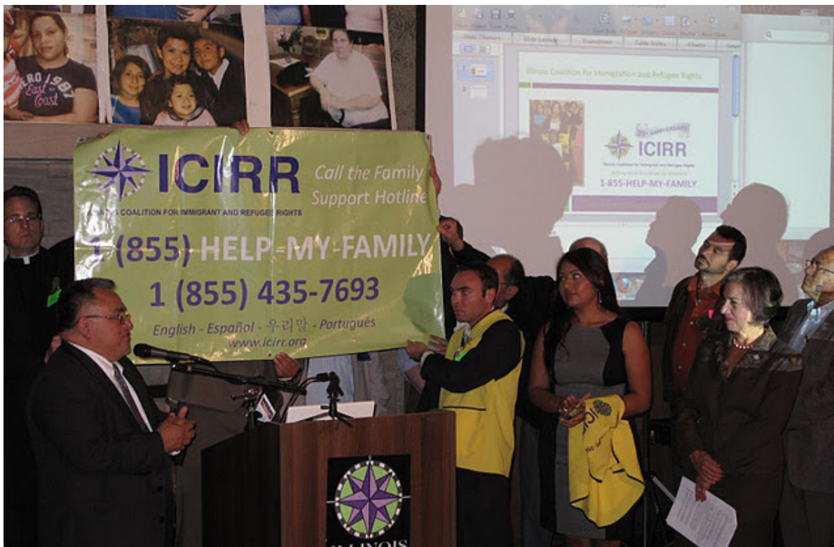
Launch of ICIRR's volunteer run Family Support Hotline.

Contact one of the organizations listed in Appendix B for advice.