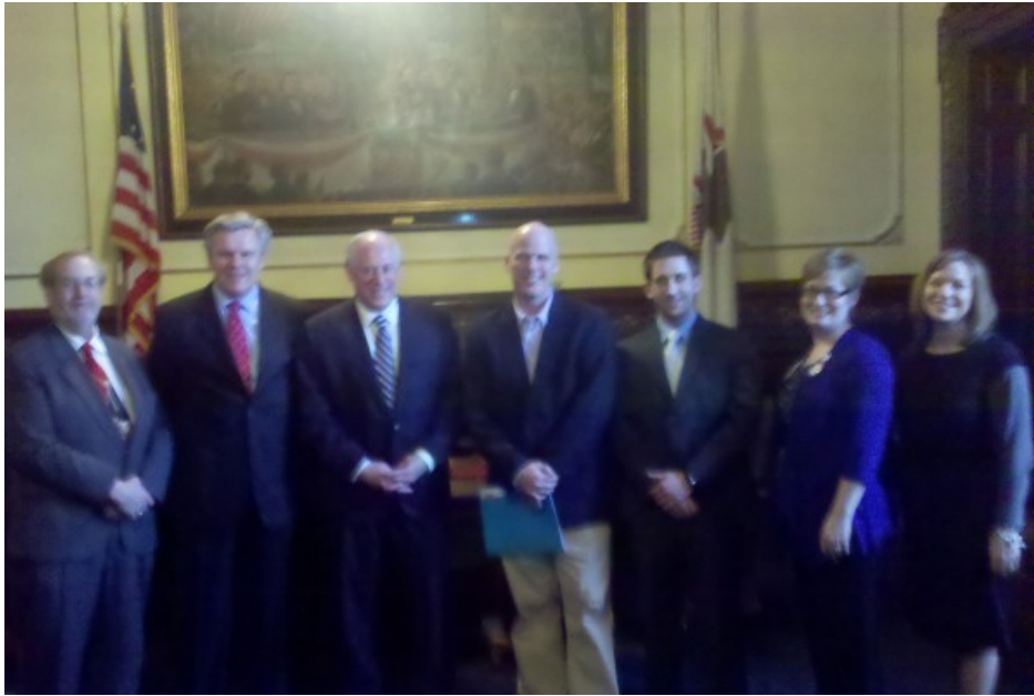
Members of IACAC and ISCA met with Governor Pat Quinn to discuss the MAP Grant and counselor ratios for students in Illinois.